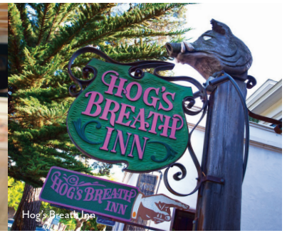
Hog's Breath Inn