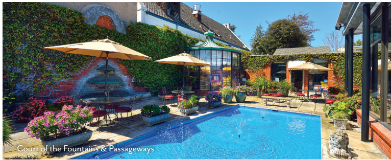
Court of the Fountains & Passageways