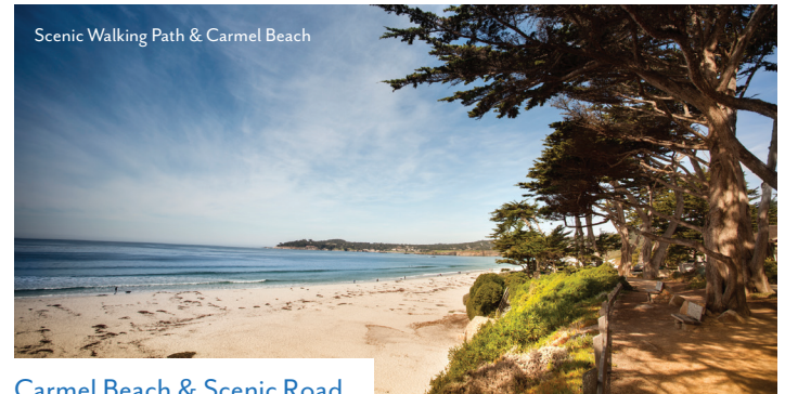
Scenic Walking Path & Carmel Beach