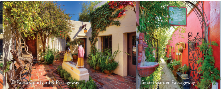
El Paseo Courtyard & Passageway