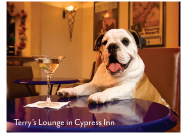
Terry's Lounge in Cypress Inn

No one is exactly sure when it began or how, but thanks to celebrities such as Doris Day and Betty White, pets get the limelight in Carmel. Many restaurants, shops, art galleries, and inns are pet-friendly.