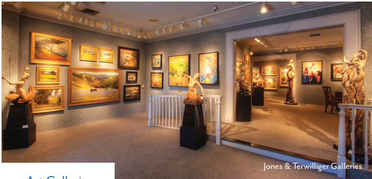
Jones & Terwilliger Galleries